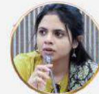
Parna Dey ECE, 2017 Deputy Magistrate, Govt of WB.