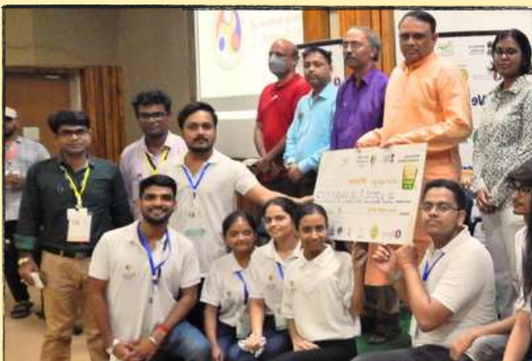
Winner, SMART INDIA HACKATHON (2022)