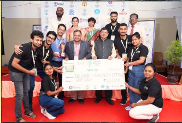
Winner, SMART INDIA HACKATHON (2023)