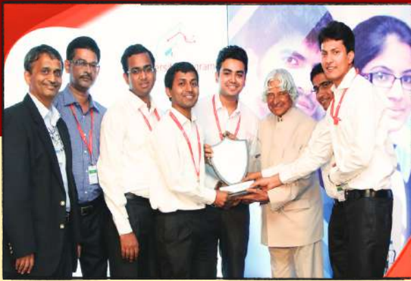
Winner USD 5000, The Texas Instrument Innovation Challenge India Design Contest (2015)