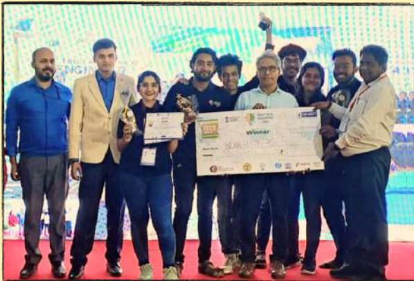
Winner, SMART INDIA HACKATHON (2023)