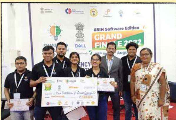
Winner, SMART INDIA HACKATHON (2022)